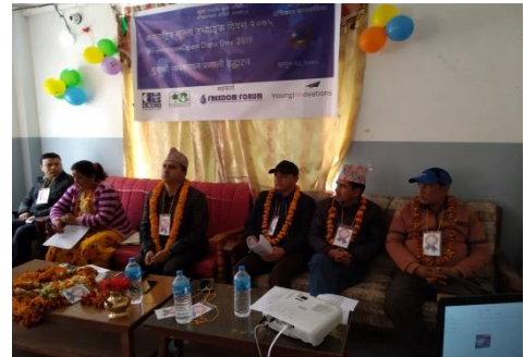
8th International Open data Day celebrating in Sanfebagar Municipality